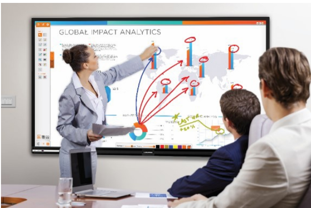
Multi writing, remote collaboration