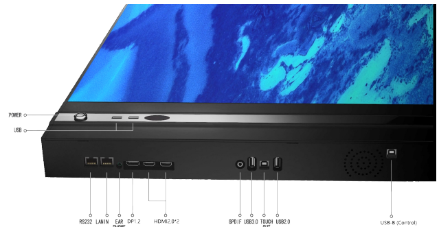
Product Interface diagram

The Planar iHub136, Ultra HD resolution, and 500nits brightness guarantee everyone in the room will be able to see even the most detailed on-screen content. Extremely fast and responsive touch delivers effective interactive experiences. Our product has rich interfaces and can play USB playback.