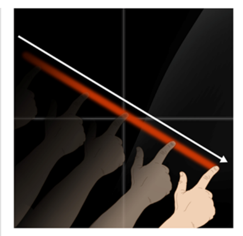
Modular design creates continuous touch surface

Clarity Matrix MultiTouch features an ultra-slim profile with Planar<sup>®</sup> EasyAxis<sup>™</sup> Mounting System. The Planar EasyAxis Mounting System also enables fine adjustments to achieve perfect panel-to-panel alignment, creating a continuous touch surface.