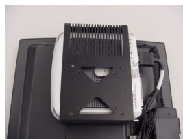
Figures 4 and 5: Slide thin client from left to right until it clicks into place.