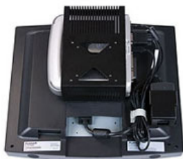
Figure 3: Fully integrated unit