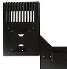
Figure 2: V-Series Bracket