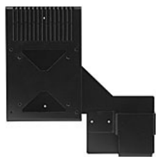
Figure 1: C/S-Series Bracket