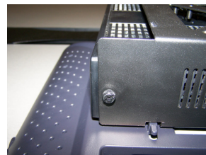
Figures 3 and 4: Slide thin client from left to right. Attach thin client to bracket using the two screws included with the thin client.