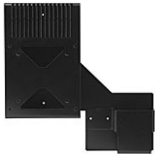
Figure 1: R50L Bracket