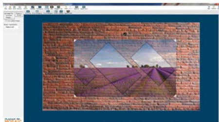
Planar Mosaic Project Designer software (Windows® edition)

Many video wall users want a single video scaled across the entire Planar Mosaic array, and occasionally have individual sources appear on individual Planar Mosaic tiles. This can be achieved multiple ways. For details and recommendations, download the Planar Mosaic Content Guide on www.planar.com/mosaic .