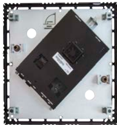
Mosaic Mount for Planar Salvador AD22-tile

In addition to supporting any tile rotation or pitch, the Mosaic Mount for Planar Salvador AD22-tile features push-in/push-out snap catches and auto-alignment posts, eliminating the need for fine-tuning.