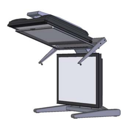
StereoMirror in 2D mode

Your SD2220W unit can operate either as a 3D stereoscopic monitor or in the standard 2D mode. Converting to 2D viewing can be accomplished by either turning off the power to one of the monitors or by putting the mirror into the locked upright position. To move the mirror to the raised position, use two hands to slide it up the mirror support arms and then raise it until it drops into the locked position. To lower the mirror, use two hands to lift it out of the locked slot and then lower it down onto the fine adjustment screws.