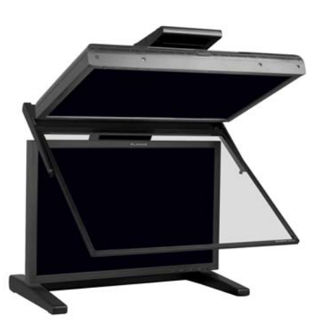
The StereoMirror monitor

Stereoscopic/3D viewing can help a viewer make faster, more accurate, and more enjoyable interpretations of imagery. The SD2220W StereoMirror™ monitor, in particular, creates an unprecedented level of stereo/3D viewing quality and viewer comfort.