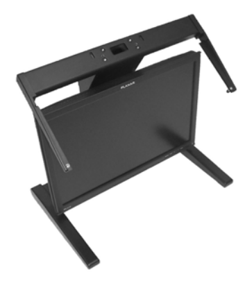
Bottom monitor assembly with mirror support arms and mirror adjustment screws

The SD2220W shipping box contains the following components: