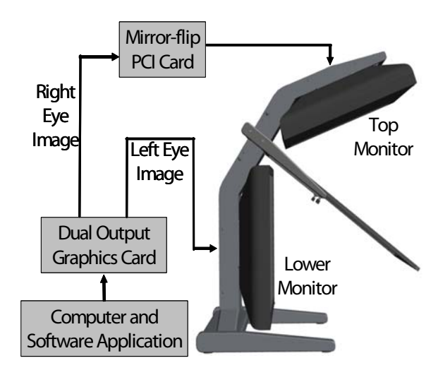
Driving the StereoMirror monitor

Since the upper display of the monitor is seen in reflection, a mirror-flip operation must be performed on that data path. In the current product this is accomplished using an auxiliary signal processing board in the data path to the