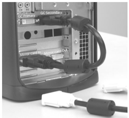
Short DVI cable installed