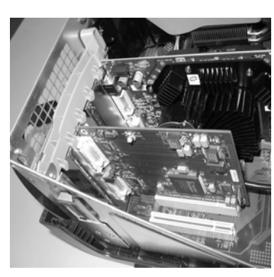
Mirror-flip PCI card installed