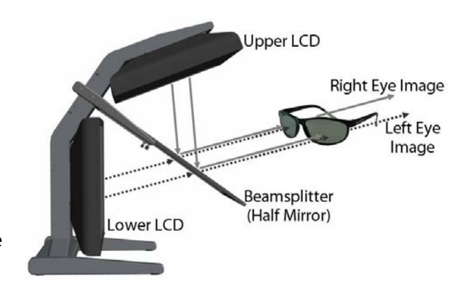
Operating principle of the StereoMirror monitor

Liquid crystal displays operate based on the ability of liquid crystal material to modulate plane-polarized light. The two AMLCDs in the SD2220W model have been manufactured so that the polarized light emitted from the top monitor is 90° rotated